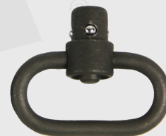
1.25" SLING WEBBING PN: P-PB-1125