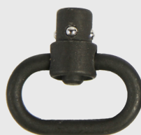
1" SLING WEBBING PN: P-PB-100